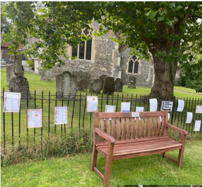
St Mary's Church railings, displaying our children's Harvest Poems.