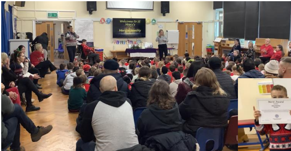
Children being presented their awards.