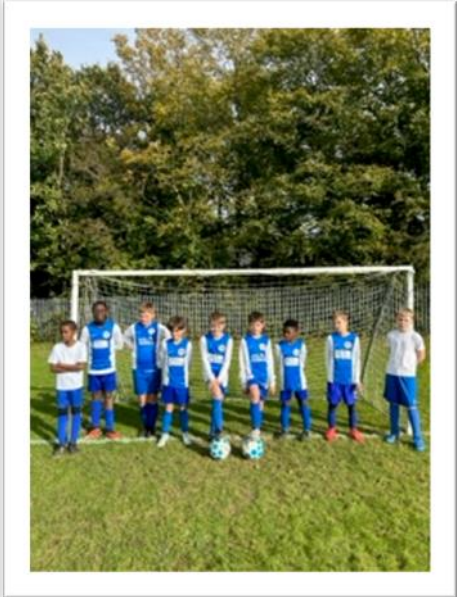
St Mary's Football Team