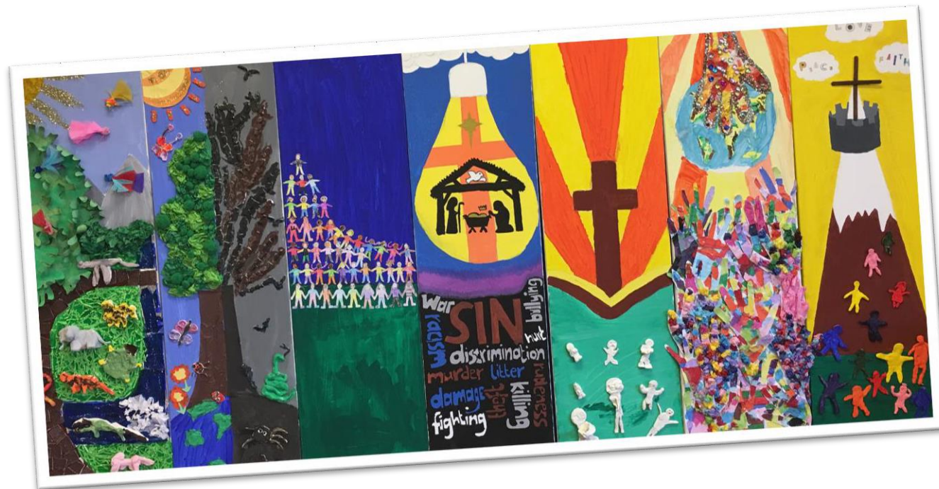
The Understanding Christianity Big Frieze. Created by children at St Mary's, Welham Green.

Strong links are made with our School Vision, "Flourish for the future", alongside the twelve values that are the bedrock of our Christian Collective Worship.