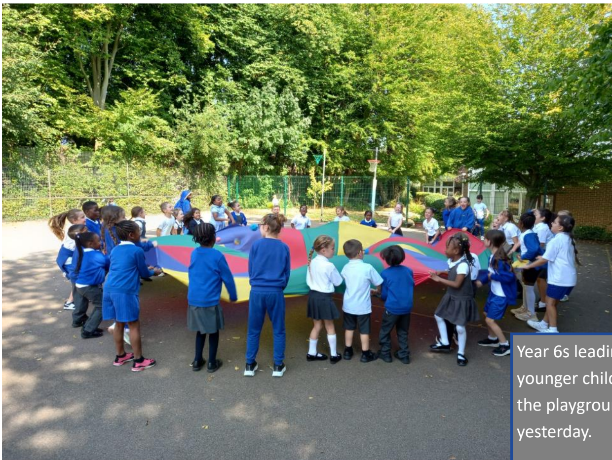
Year 6s leading the younger children in the playground yesterday.