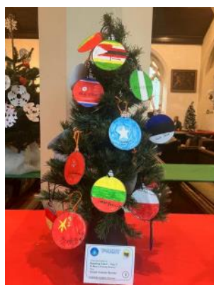
Year 2 - Hawking Class