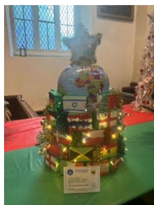
Year 6 - Goodall Class