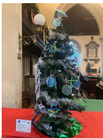
Year 1 - Curie Class