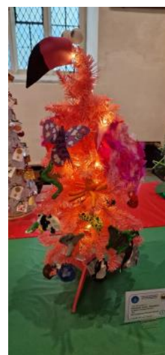
Reception - Elizabeth Class