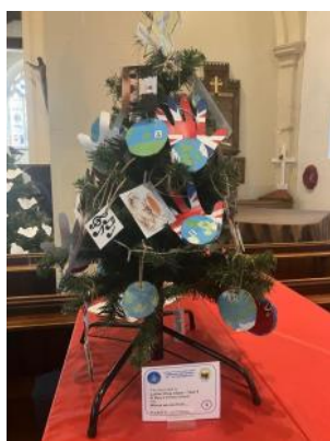
Year 5 - Luther King Class

As you will be aware St Mary's Church are holding a Christmas Tree Festival this weekend. The different classes at school have used their creativity to design and submit their Christmas trees to the Festival. There are going to be three prizes at the Festival for the most popular trees and these are decided by the votes of the visitors to the church. So please go along to the church and vote for the tree that your child's class has designed! The Festival is open for visitors on Saturday 9th December 10.00am – 4.00pm and Sunday 10th December 12.00pm – 4.00pm.