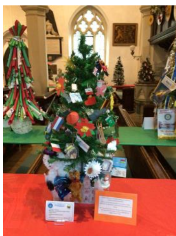
Year 3 & 4 - Mandela & Attenborough Class